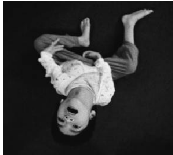
Collateral Damage: Agent Orange published by Trolley Books

Accords signed in Paris in 1973 the administration of Richard Nixon promised to contribute $3 billion dollars toward healing the wounds of war, and to post-war reconstruction of Vietnam. Nonetheless, 30 years after the end of the Vietnam War, our government has yet to make good on its formal commitment and moral obligation to assist the Vietnamese people's recovery from the chemical warfare waged against them and their land. Neither has it met its responsibility to the peoples of Laos and Cambodia, whose lands were also poisoned by the same chemical weapons. Our focus is achieving justice for the Vietnamese victims of Agent Orange. We are also mindful of the fact that our government has continued to use chemical weapons, including depleted uranium and napalm, in Iraq and other places. Our actions therefore are part of an on-going international campaign to end the use of toxic weapons and to achieve justice and accountability for all victims. The Vietnam Agent Orange Relief and Responsibility Campaign is an initiative of U.S. veterans, Vietnamese Americans and all concerned about peace and justice. Vietnamese citizens have filed a lawsuit to hold the chemical companies responsible for the crimes against humanity of which their products were a part. Now it's