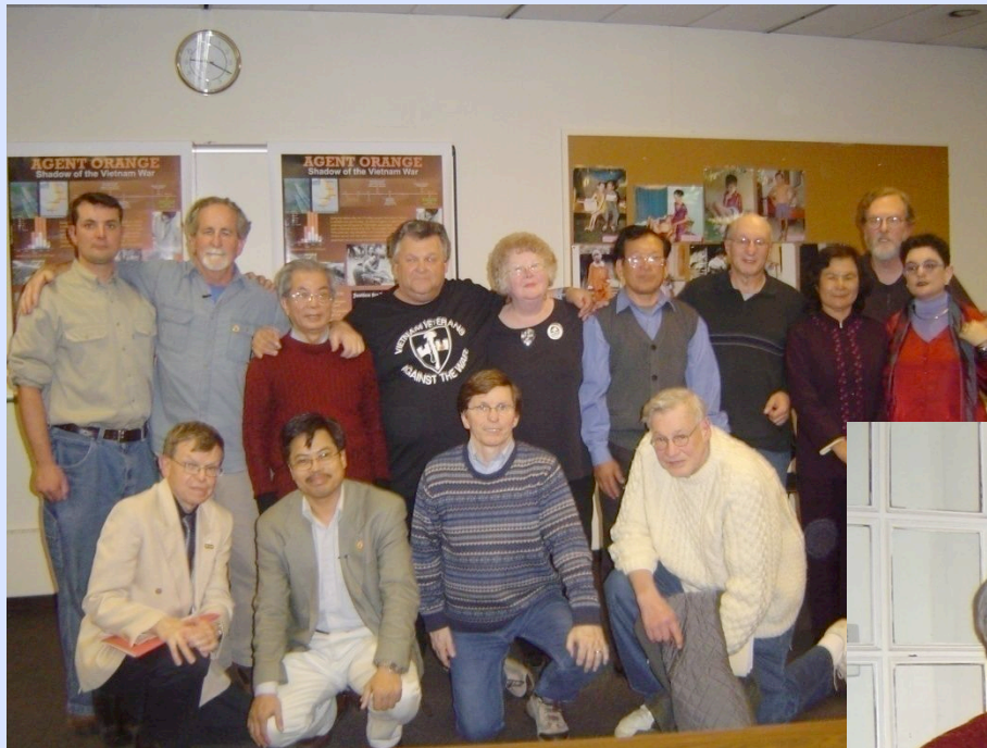
The American Friends Service Committee...