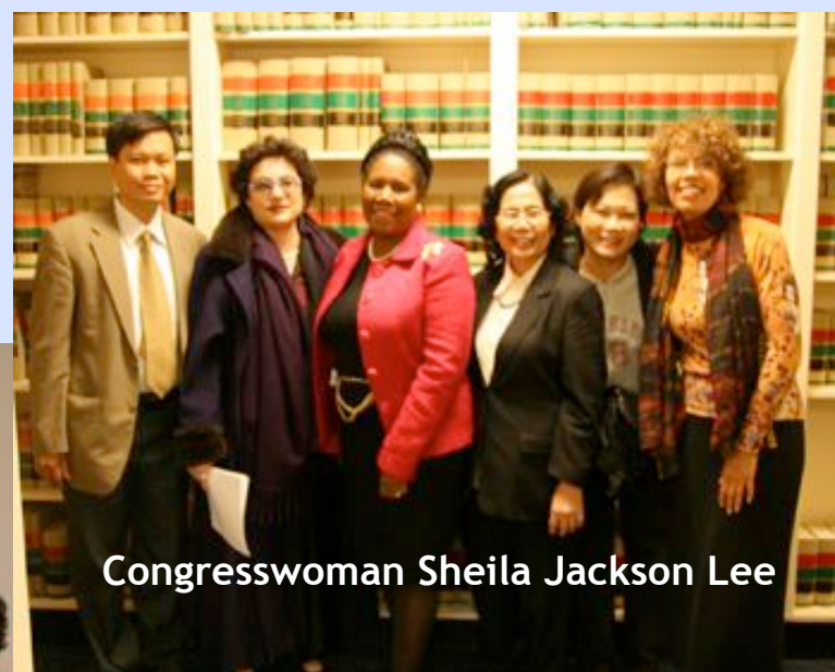
Congresswoman Sheila Jackson Lee