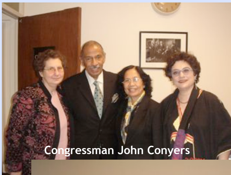
Congressman John Conyers