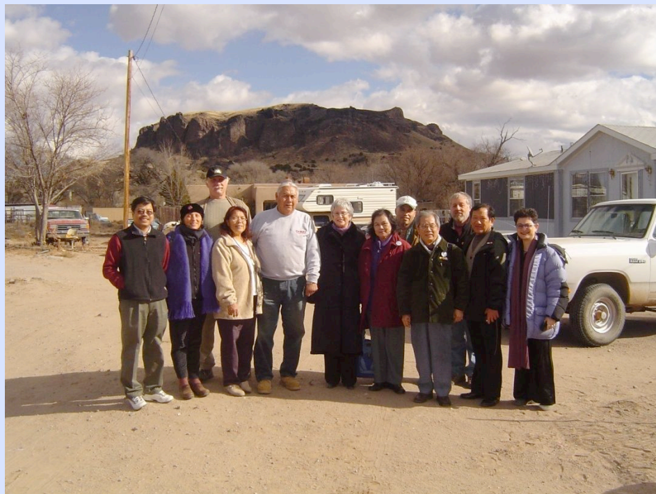
Meeting with Native American leaders...