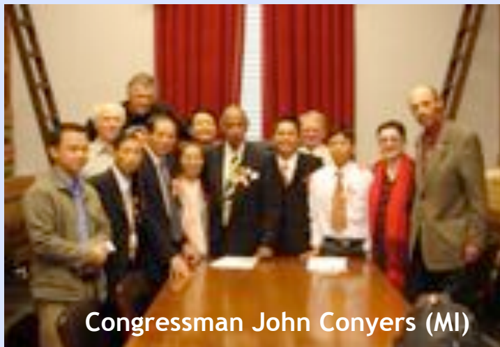
Congressman John Conyers (MI)