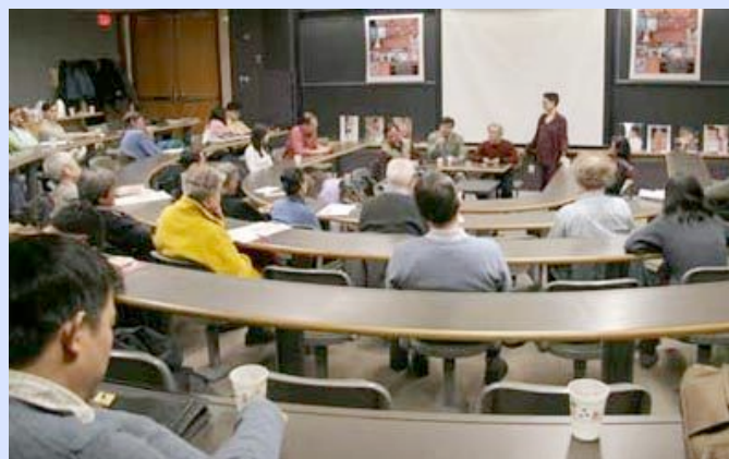
Speaking at Harvard University, Boston, MA