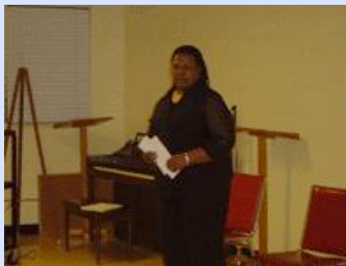
Speaking in Raleigh, NC