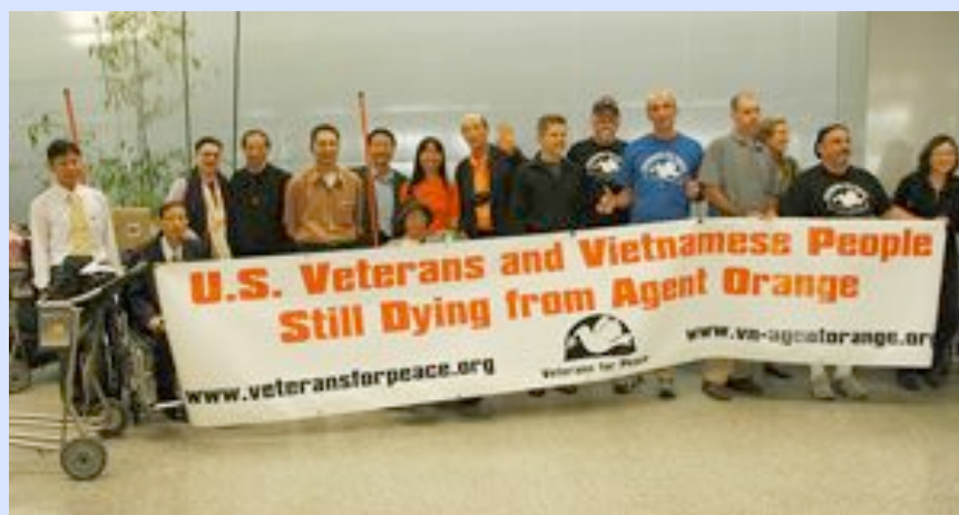
Greetings in San Francisco International Airport