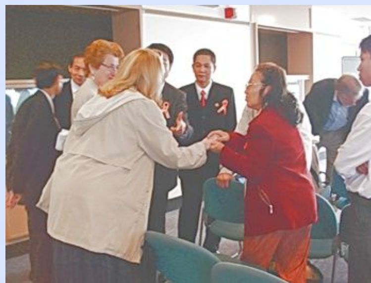
Greetings at the 777 United Nations Plaza