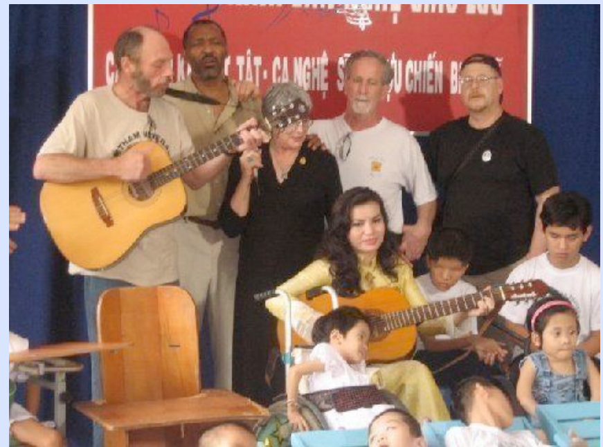
U.S. delegation jamming with artists and AO children, March 2006.