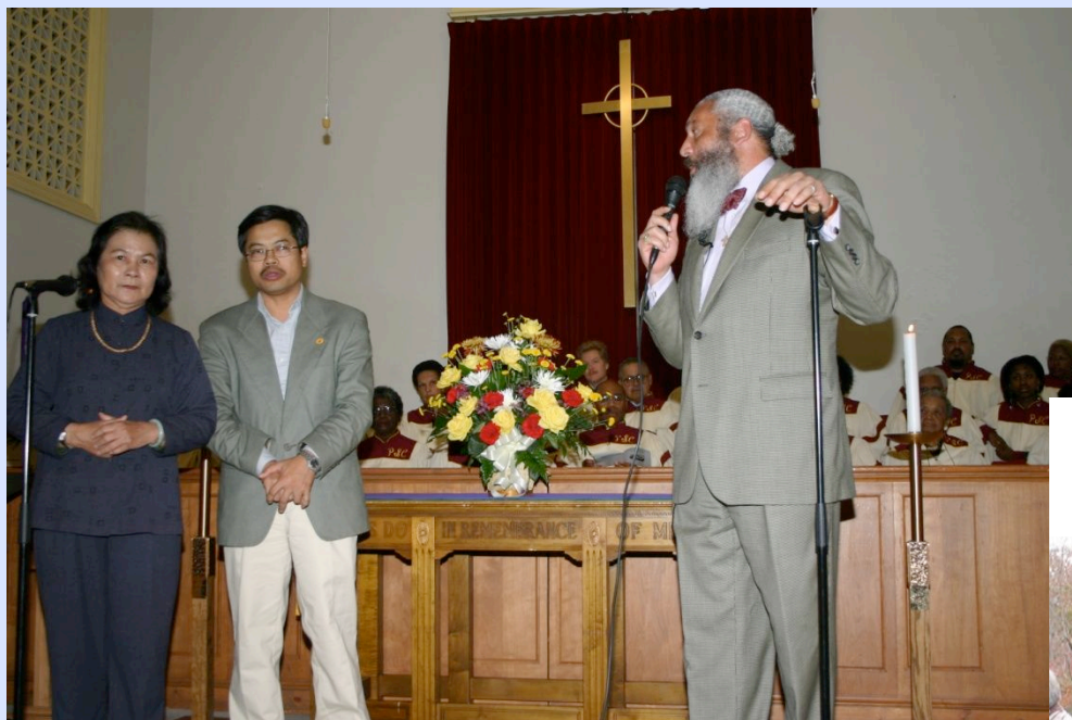
At the mass of the Plymouth Congregational Church, and at the Veterans Memorial Wall...