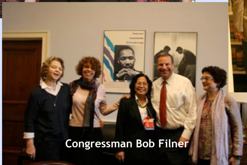
Congressman Bob Filner