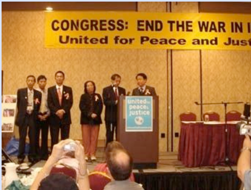
Press Conference in Chicago