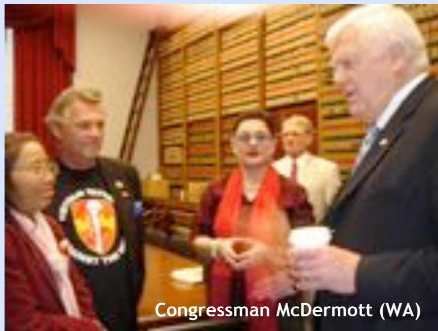
Congressman McDermott (WA)