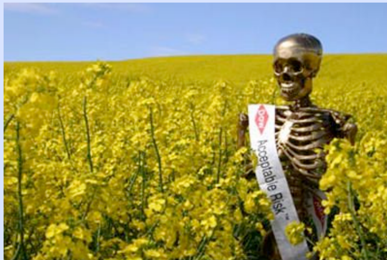
The Yes Men, Acceptable Risk, 2005