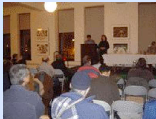
Speaking in Chicago, IL