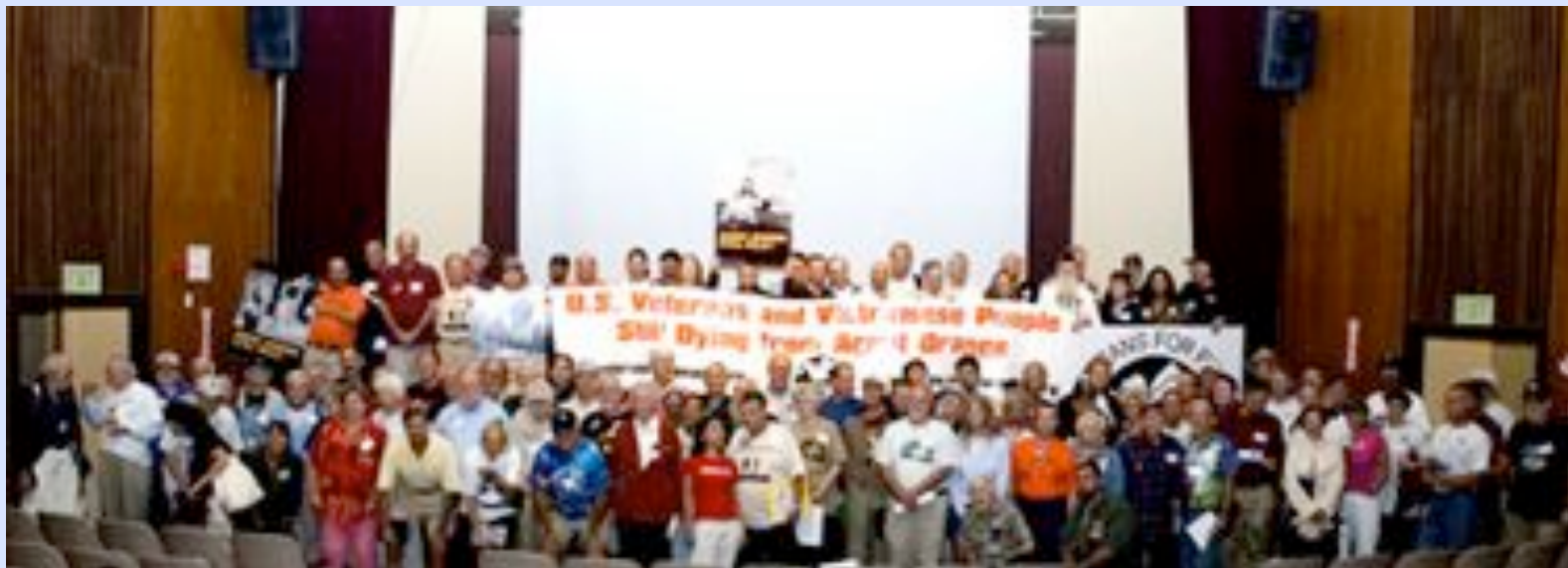
At the Veterans For Peace National Convention at the University of Washington in Seattle, August 9-12, 2006.